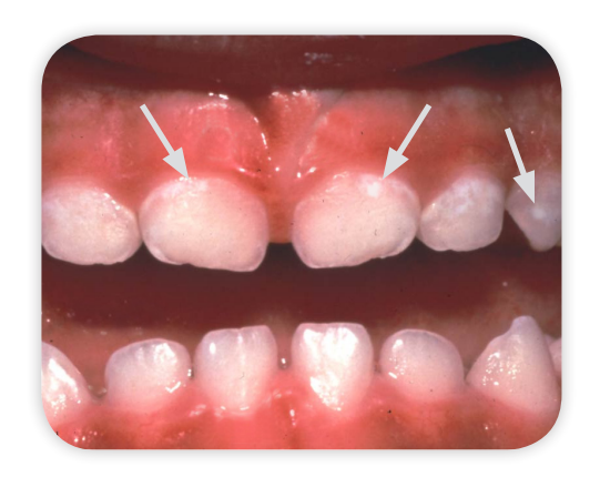
White spots (the start of cavities)