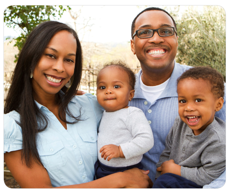
Washington Dental Service Foundation